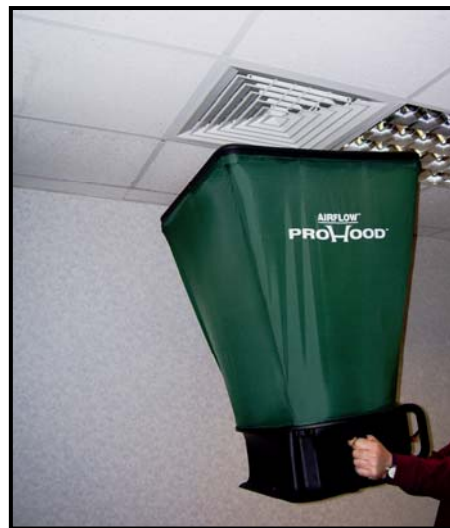
Figure 1 - Balometer Airflow Measuring Hood

Switch on the fan coil unit air distribution system including any central plant air handling units and/or any separate extract system(s). After the system has been operating for at least 20 minutes, air flow measurements are taken at each discharge diffuser/grille using a suitable instrument such as balometer measuring hood (see Figure 1) or custom-made hood with vane anemometer. All instruments must have current calibration certification traceable to a national calibration standards body.